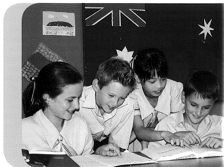
Students from All Saints Anglican School, Queensland

In Australia, there is no national operational definition of learning difficulty, and there is considerable overlap in the use of this term and learning disability (Scott 2004). The former term is usually applied to students based on their classroom performance, and on the results of school-based or state-mandated 'basic skills' assessments, rather than on the diagnosis of an individual profile of specific cognitive processing difficulties. Australian educators and researchers generally make a definitional distinction