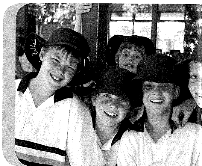
Students from All Saints Anglican School, Queensland